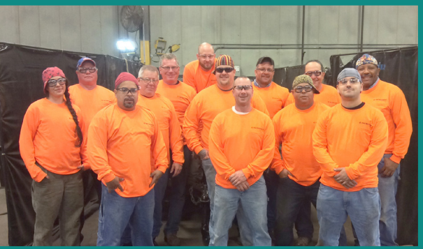
North Bergen Shop