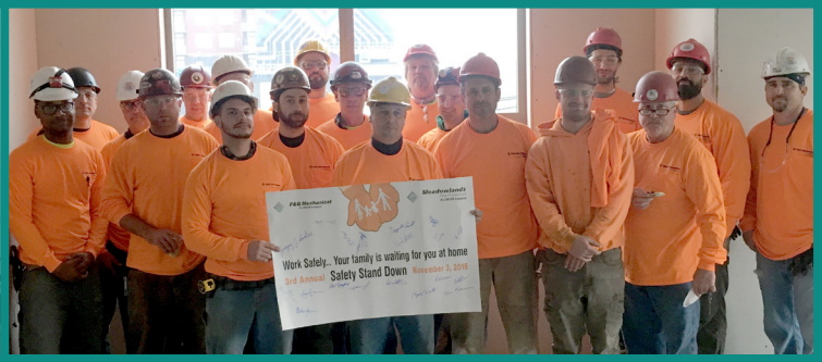
SOHO West Towers 1&2