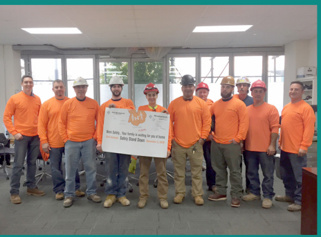
Port Imperial Site 7 & Hotel