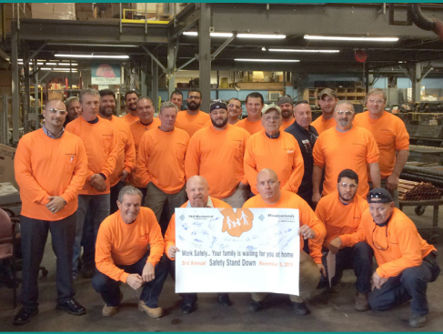
Shop & Service