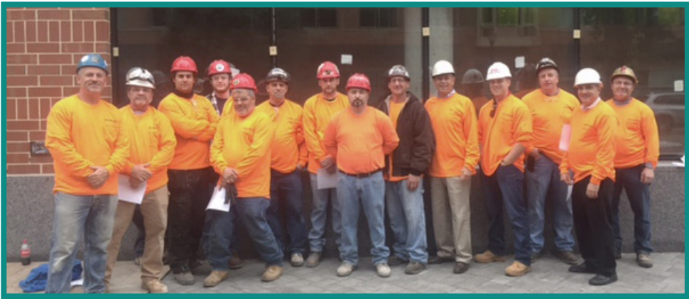
Hudson Tea Building E